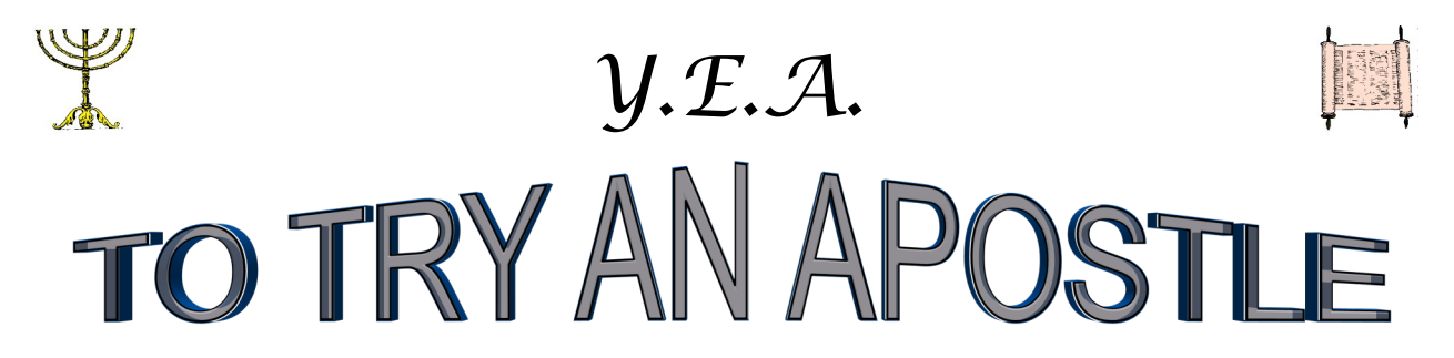
In the book of Revelation, chapter two, verse 2 the Messiah commends the assembly at Ephesus for they, "Tried them which say they are apostles, and are not, and have found them LIARS."

One has walked among us during these last days proclaiming, "I am God's apostle! I dare anyone to question my authority!"