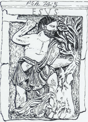
The pagan Celtic god Esus, pronounced Hesus.

writes, “Now of all none has such to be considered as sacred tree of the ship is attested for branches of the Europe. We have not only the sacred pal object of wor-and Slavs. Accord-oak ranked first trees of the Ger-deed their chief known to have been the age of heathen-its worship have