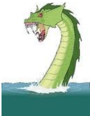
Artistic rendering of a great sea serpent.

#3867 is the Hebrew word “lavah”; a prim. root; prop. to twine , i.e. (by impl.) to unite , to remain ; also to borrow ( as a form of obligation ) or (caus.) to lend . It is variously translated as; abide with, borrow (-er), cleave, join (self), lend (-er).