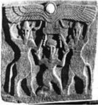
Another form of the Trinitarian bull.