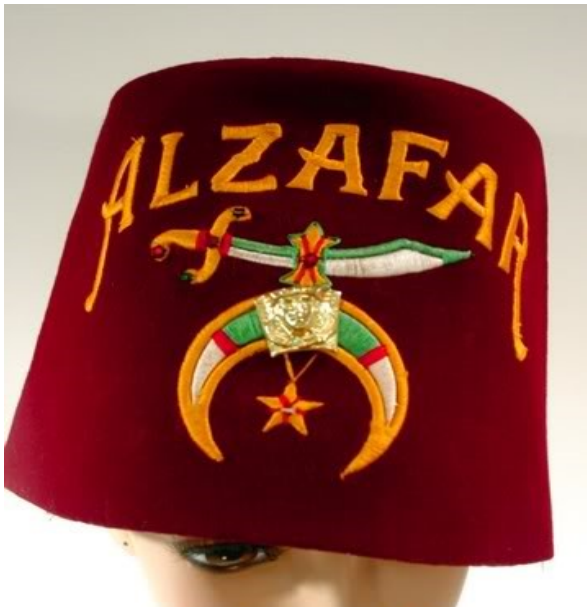
Figure #3—Alzafar Fez

Situated in the middle of the moon symbol is the Sphinx. This represents the Great Sphinx of Egypt which has its roots thoroughly in ancient Egyptian paganism and demonic symbolism.