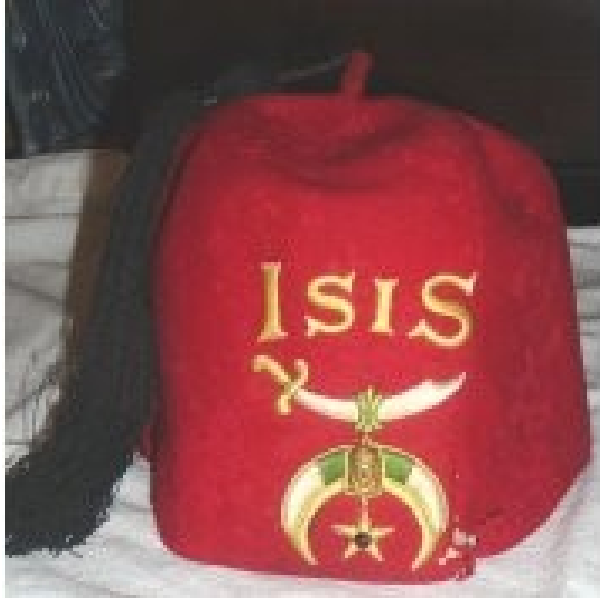
Figure #1—Original Masonic Shrine Fez and pouch dated Dec. 4th, 1923.

The real truth behind the Shriner's side of