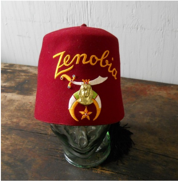
Figure #2—Zenobia Shrine