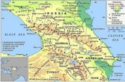
Caucasus Region located between the Black and Caspian Seas.

The northern kingdom of Israel went into captivity by the hand of the Assyrians who secluded them in the Caucasus Mountains area for that 390 years. (See maps)