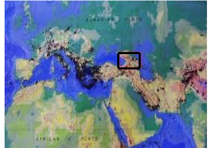
Caucasus Region in relation to the surrounding world.

With the initial great defeat of Darius at Issus in 332 BCE the doors were opened for the captive Israelites to sweep northward and then westward into Europe, England, and eventually America as well as other parts of the world Israel has been known to have migrated to. Their tenure was from 722 BCE to 332 BCE, exactly 390 years!