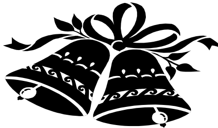
Pagan bell (Baal) symbols

{The Origin of December 25 as Christmas: The exact date of Christ's birth is not known. For the first two centuries, while Christians were being persecuted for their new faith, the Christian church did not celebrate Christmas. Soon after A.D. 200, however, Christmas was being observed, but on various dates-especially Janu-