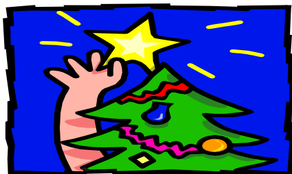
The Christmas Tree and Star. Pagan symbols.

{...The holly, the mistletoe, the Yule log and the wassail bowl are relics of pre-Christian times...The cus-