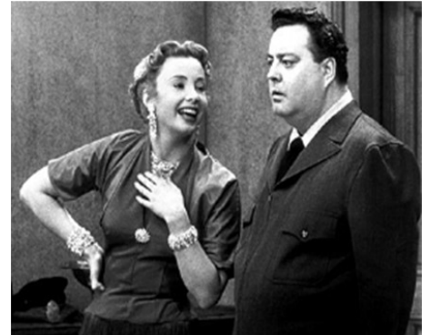
Jackie Gleason and Audrey Meadows as Ralph and Alice Kramdon.

Your spouse is nothing like you. There's going to be dis-