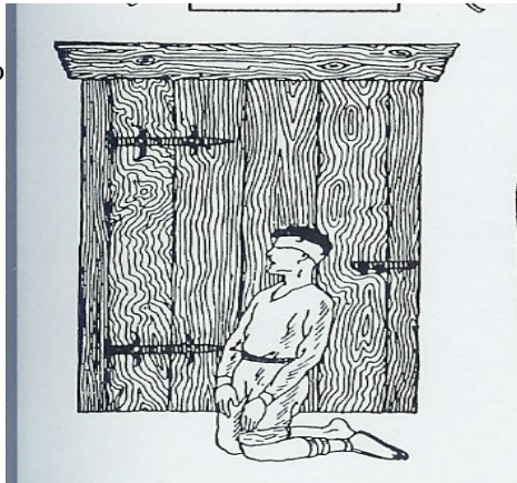
The Hoodwinked Pauper

As we should know, when we call someone two-faced, we mean that they are deceitful. We also say that they are speaking out of both sides of their mouth. Janus was the god of thresholds or doorways! “In ancient Roman religion and mythology, Janus is the god of beginnings and transitions, thence also of gates, doors, doorways, endings and time. Most often he is depicted as having two faces on his head, facing opposite directions: one face looks eastward and the other westward. Symbolically they look simultaneously into the future and the past, back at the last year and forward to the next.” ( Wikipedia )